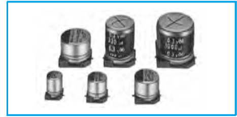
Marking color : Black print ( \phi 4 \times 5.3L - \phi 8 \times 6.5L, \phi 12.5 \times 13.5L ) : White print on a brown sleeve ( \phi 8 \times 10L - \phi 10 \times 10.5L )